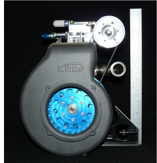
2 kW Electric Hybrid